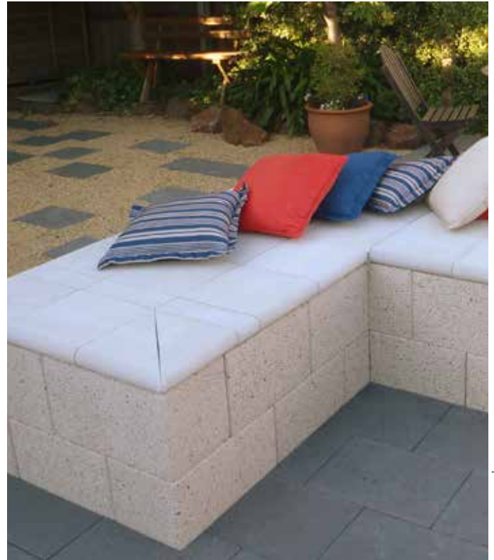
Freestone | Smooth Mist